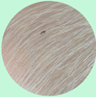
Head lice are small insects, up to 3mm long.

Unfortunately we have had a couple of cases of Nits in school this week. Please can parents make sure to check their children's hair over the weekend.