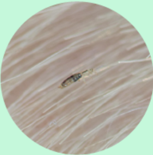
They can be difficult to spot in your hair.

There's no need to keep your child off school if they have head lice.