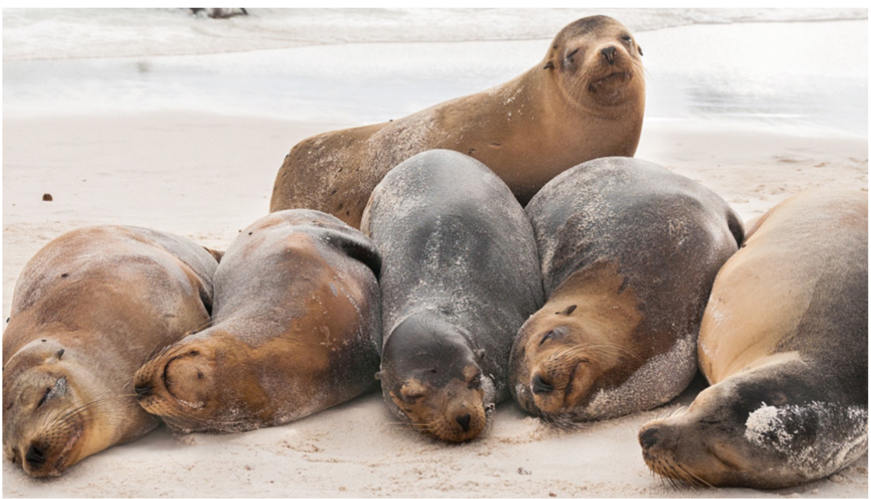
Galápagos sea lions