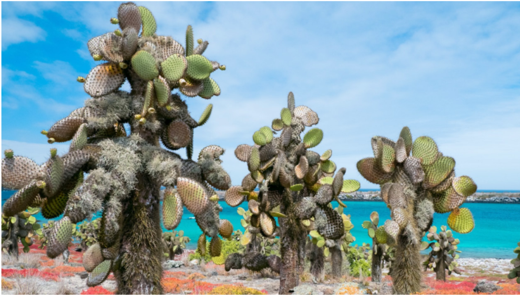
Cactus trees on South Plaza Island