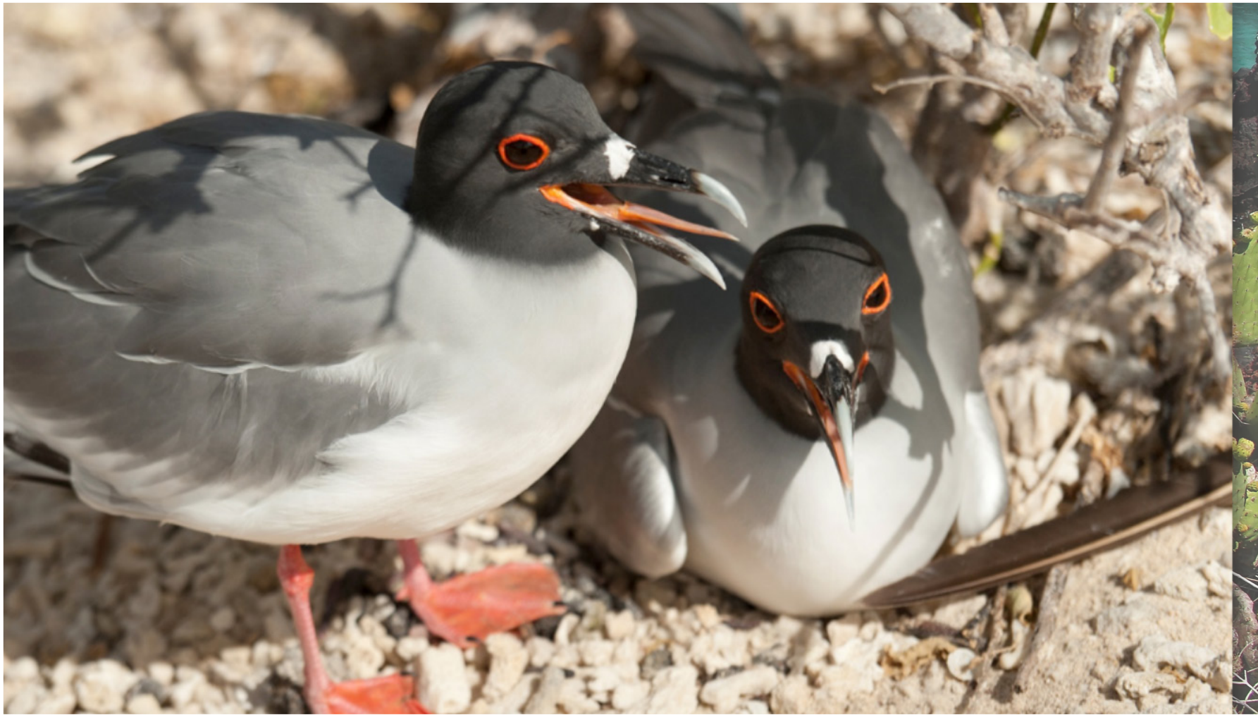
Lava gull, Genovesa Island