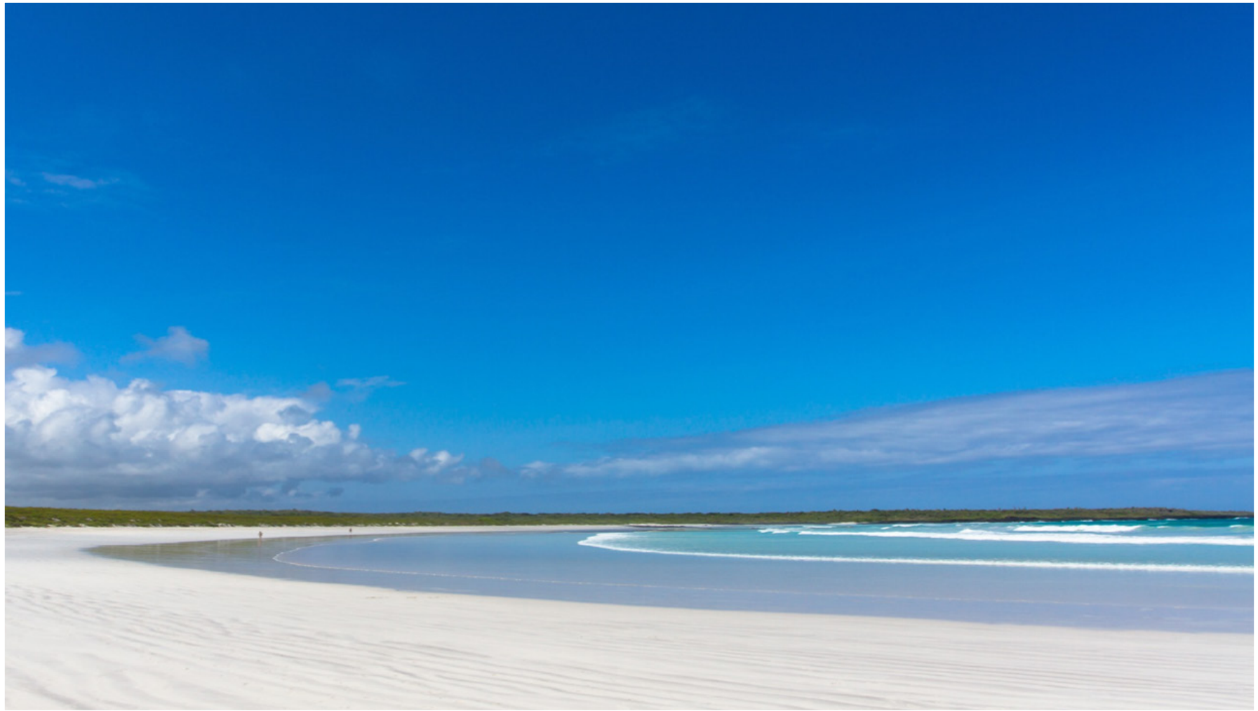
Gadner Bay Beach, Española Island