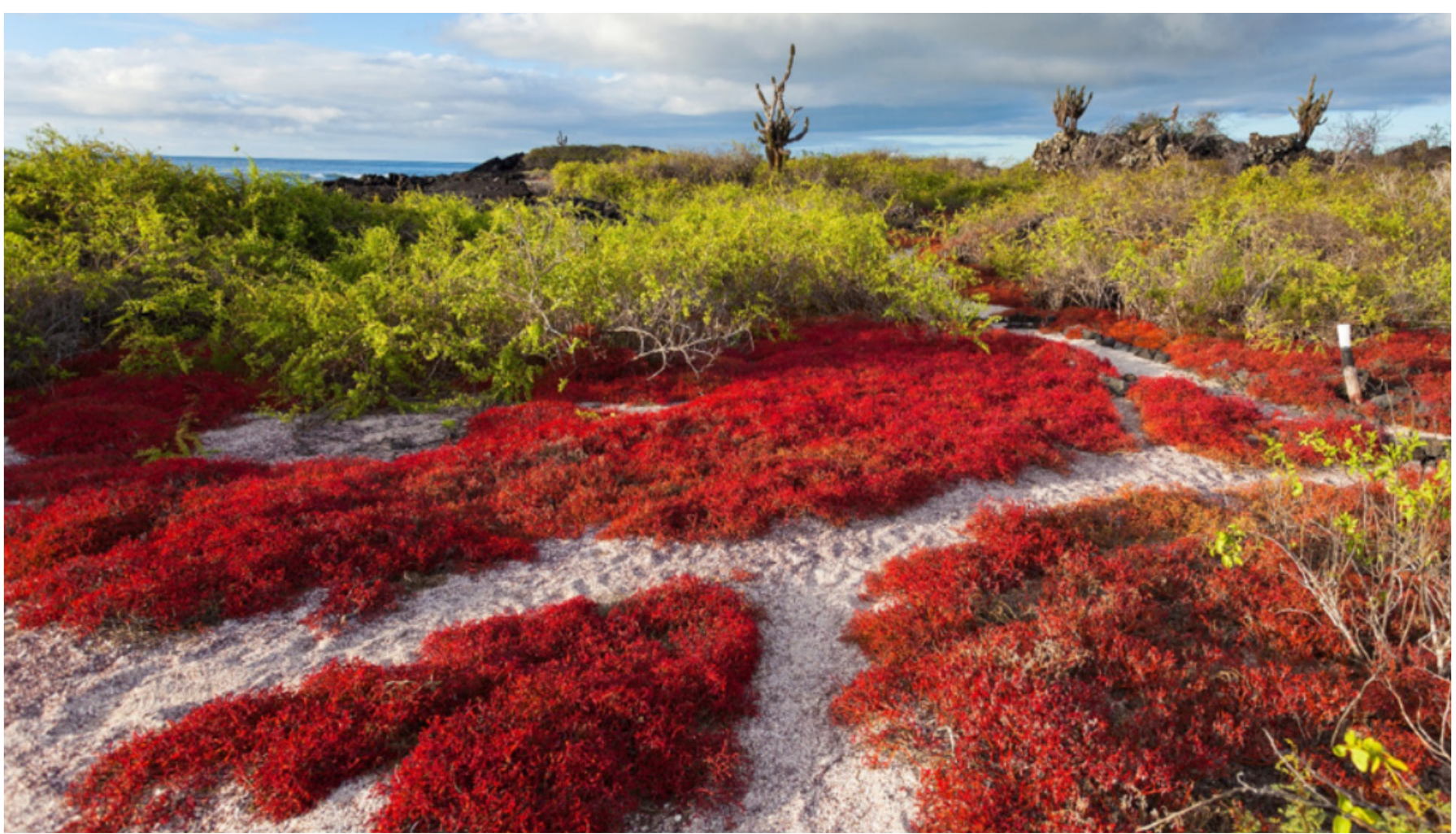
Succulent sesuvium grass, Floreana Island