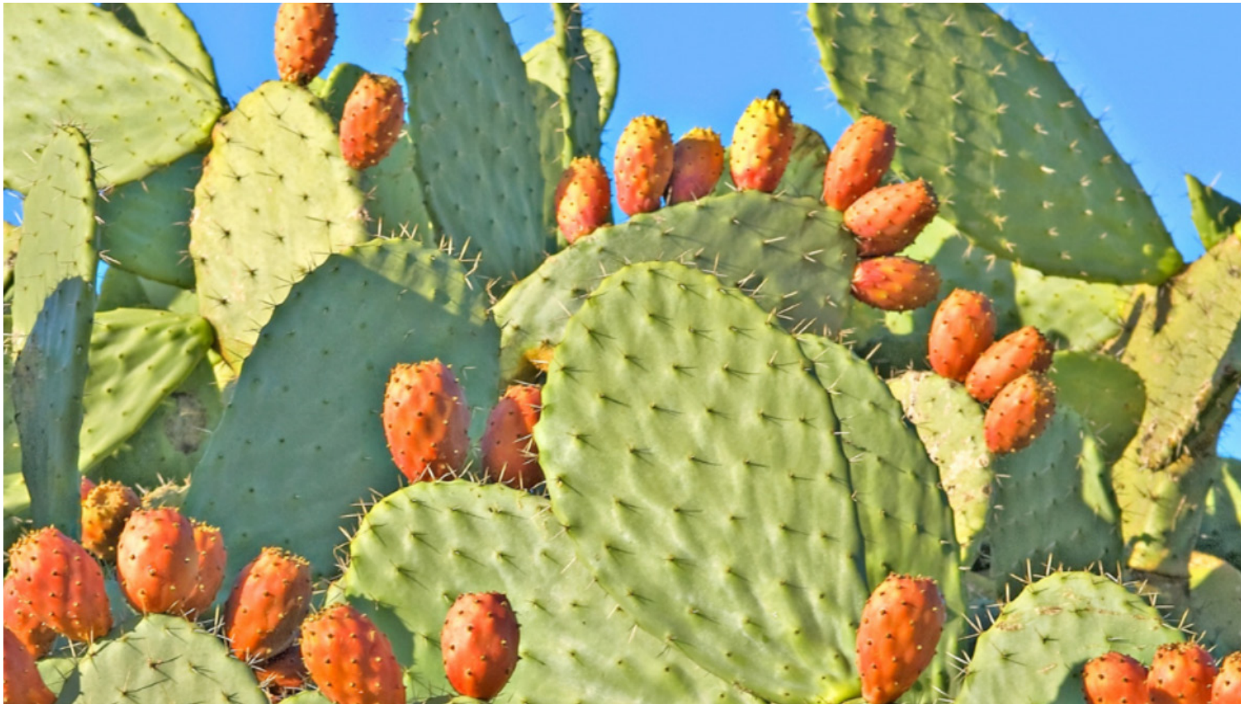
Prickly pear cactus