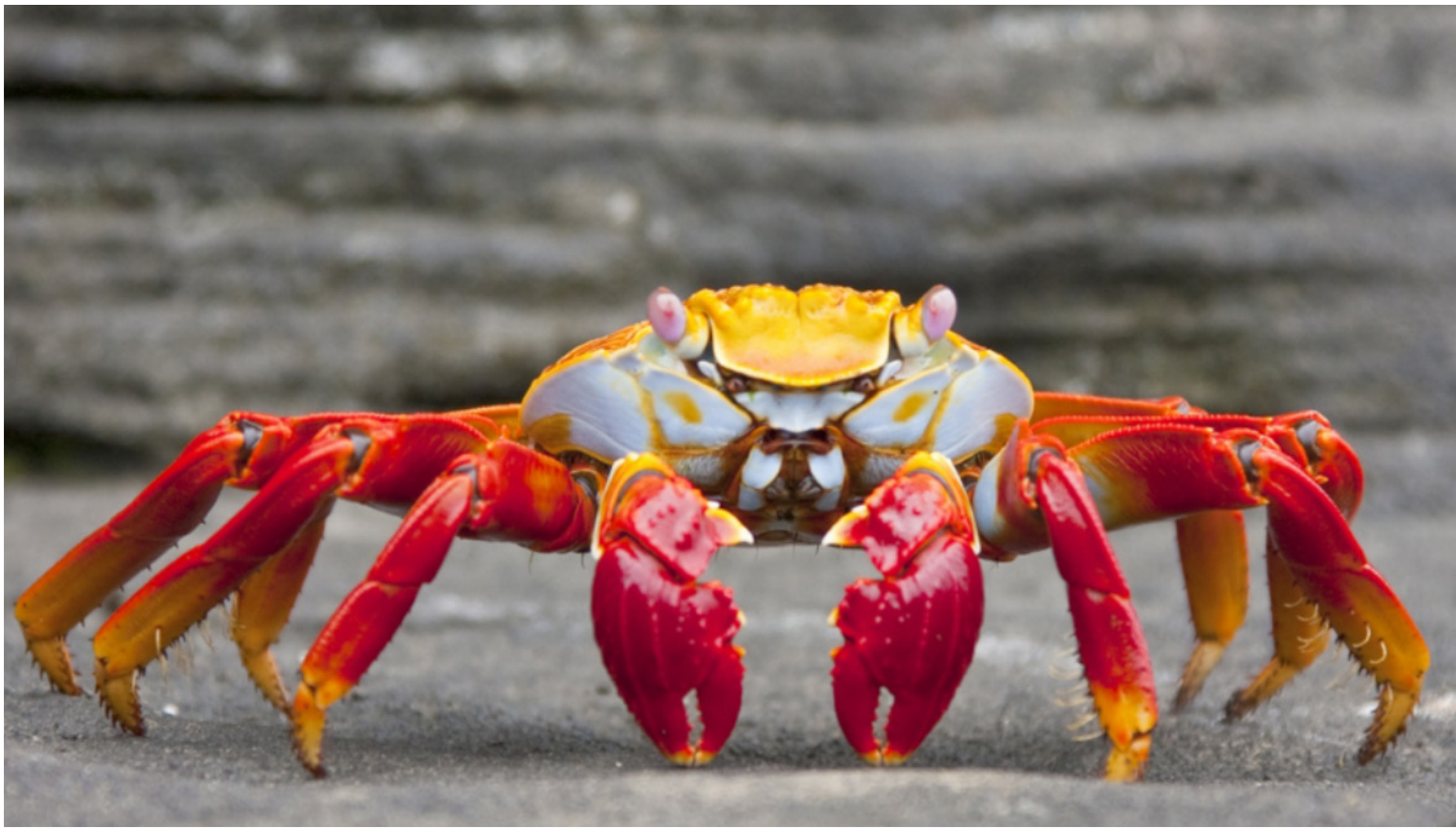
Sally Lightfoot crab, Fernandina Island