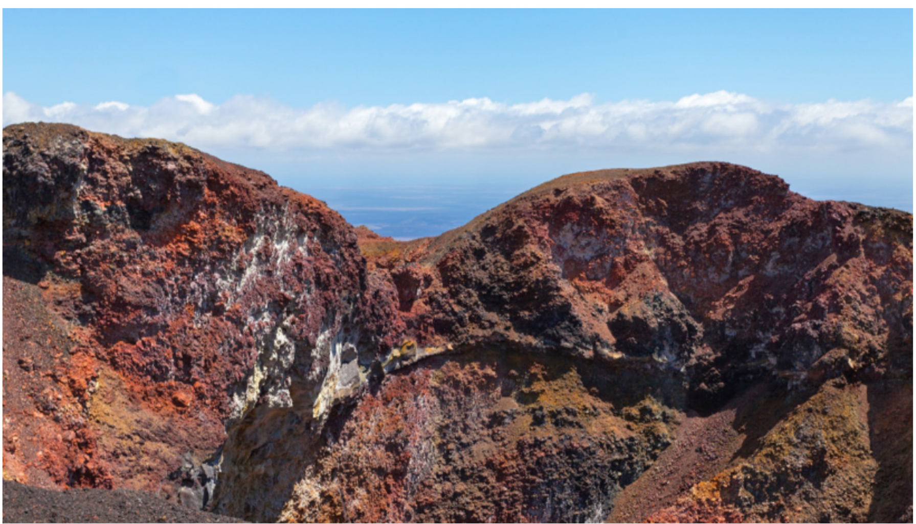
Sierra Negra volcano, Isabela Island