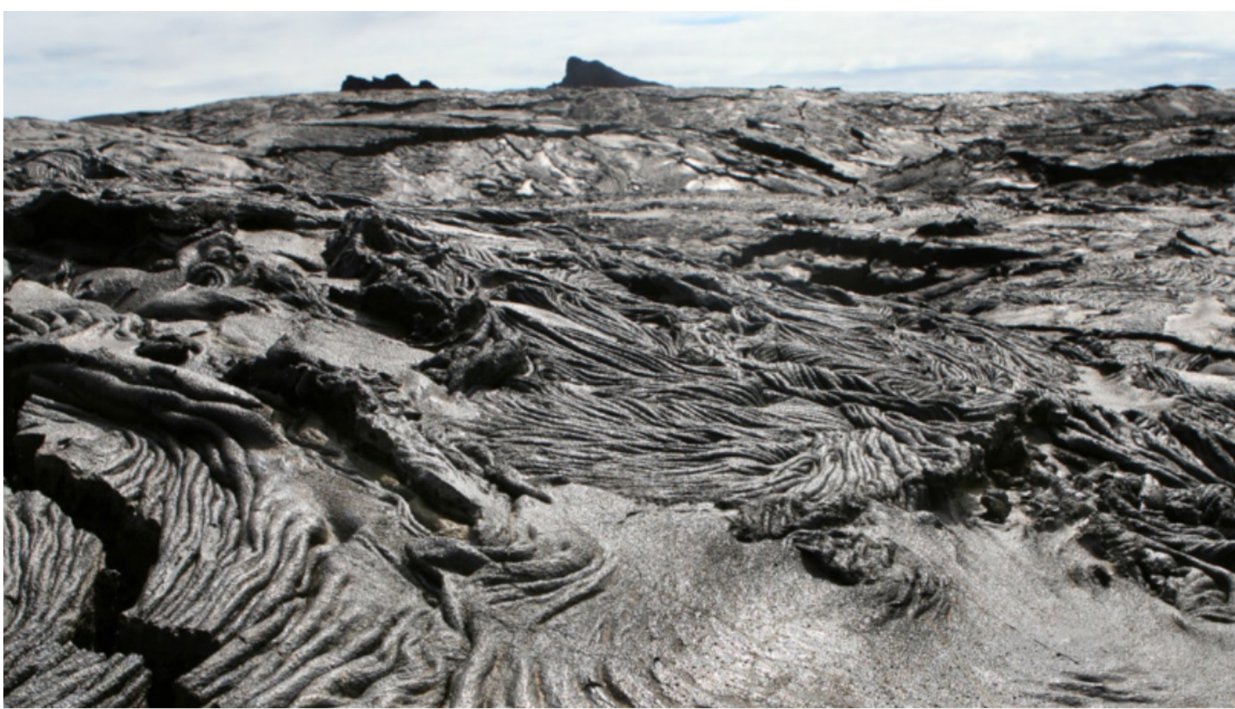
Barren lava fields on the Galápagos